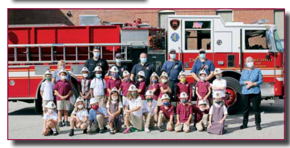
Grade 2 had a great visit with the fire department learning about fire safety and exploring the fire truck.