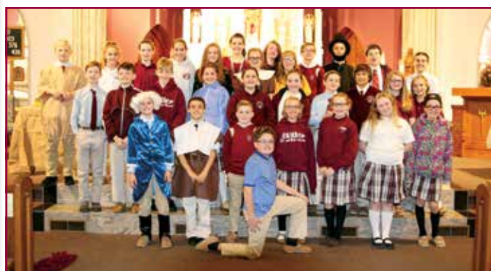
Grade 6 presented a wonderful Thanksgiving Prayer Service.