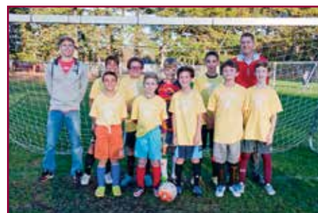
Grade 5 & 6

CONGRATULATIONS to our SJRS 5th/6th grade boys indoor soccer team with an undefeated first soccer session and reaching 2nd place in the tournament!