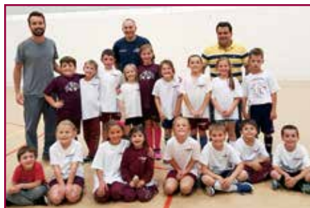
Grade K, 1 & 2