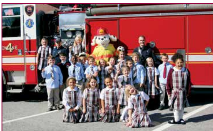
Grade 2 had a great visit with the fire department learning about fire safety and exploring the fire truck.