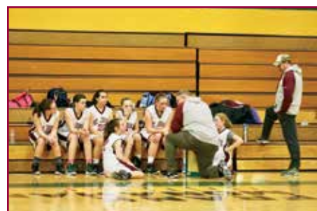
Grade 6, 7 & 8