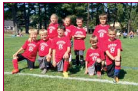
Grade 1 & 2